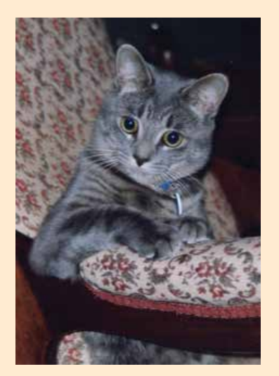
Pegasus the Counselor

For years the SJDAWC reports have told of "support from the Pegasus Family Fund of Silicon Valley Community Foundation". The Fund was set up by an animal-loving couple who live in California, who wish to remain anonymous. He, a surgeon, and she, a teacher of international folk dance, have had a vacation home in PEI since 1990, returning each summer. The summer of 1993, about to leave PEI, they found a kitten who had been abandoned on their property. They flew him back to California, home to their other cats. Named Pegasus, he lived with them in California until his death at age 9 from complications of cardiomyopathy in 2002.